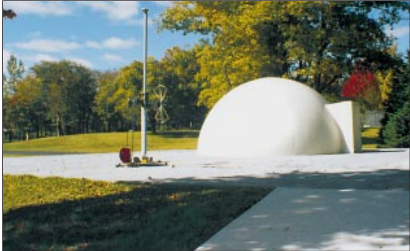
Open Area Test Site (O.A.T.S.). Used for 3- and 10-meter testing. It is F.C.C. listed and NVLAP accredited. In addition, the site was assessed by ACEMARK Europe, LTD which is recognized by numerous European competent bodies.

Due to the global proliferation of electronic devices in non-military living, it is becoming increasingly important that EMC be maintained in civilian settings as well. Residential and commercial environments may contain dozens of appliances that are controlled by microprocessors, i.e., kitchen stoves, video cassette recorders, TV's, breadmakers, personal computers, etc. All electronic devices utilizing microprocessor technology generate radio frequencies.