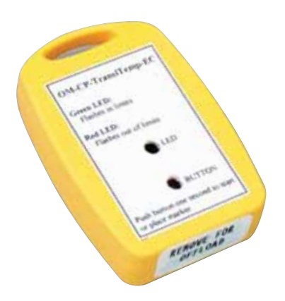
OM-CP-TRANSITEMP-EC Data Logger

An alternative approach for cold chain temperature monitoring is the single use temperature recorder. OMEGA offers both the OM-CP-TRANSITEMP-EC and the OM-21 data loggers. Compact and inexpensive, these are intended to be loaded in with the cargo at the point of origin and retrieved on final delivery. Their operating range is minus 20 to 70°C (-4 to 158°F) [minus 30°C (-22°F) for the OM-21] and as with the other loggers described, the data gathered may be easily transferred to a PC for review. (The OM-21 actually prepares the data in pdf format and behaves like a USB flash drive).