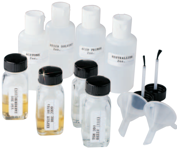
TT300, SG401, SG496 Strain Gage Adhesives

accommodate variations in temperature, time, and elongation capability. If you are applying an epoxy to glue composite sheets together, the epoxy used would be a good choice to adhere the gage. Unfilled adhesives are normally preferred to minimize creep. However, composite materials with fibers that result in an irregular surface may present difficulties in bonding. In such cases, a partially filled adhesive may be applied to smooth the surface prior to bonding the specimen to the gage with unfilled adhesive.