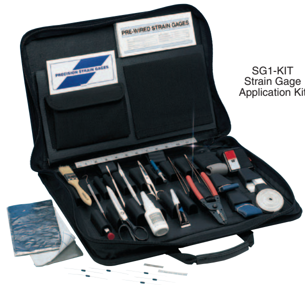
SG1-KIT Strain Gage Application Kit

Extra-long strain gages provide several advantages for strain measurements of inhomogeneous materials. They support a larger area for measurement, which allows a better representation of the material's structure. In addition, the greater surface area facilitates heat dissipation to deliver more stable measurements.