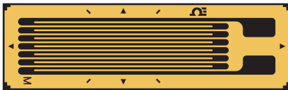
SGD-30/120-LY40 Extra-Long Strain Gage

The OMEGA® SGD-30/120-LY40 is an extra-long strain gage designed specifically for inhomogeneous materials. Its grid measures 25 by 8 mm, and the carrier is 40 by 12 mm. The nominal resistance is 120Ω, and it terminates with solder pads. Constantan foil is used to form the grid, which is sealed in a polyimide carrier. OMEGA's SGD-30/120-LY40 is flexible and strong to provide highly accurate static and dynamic measurements.